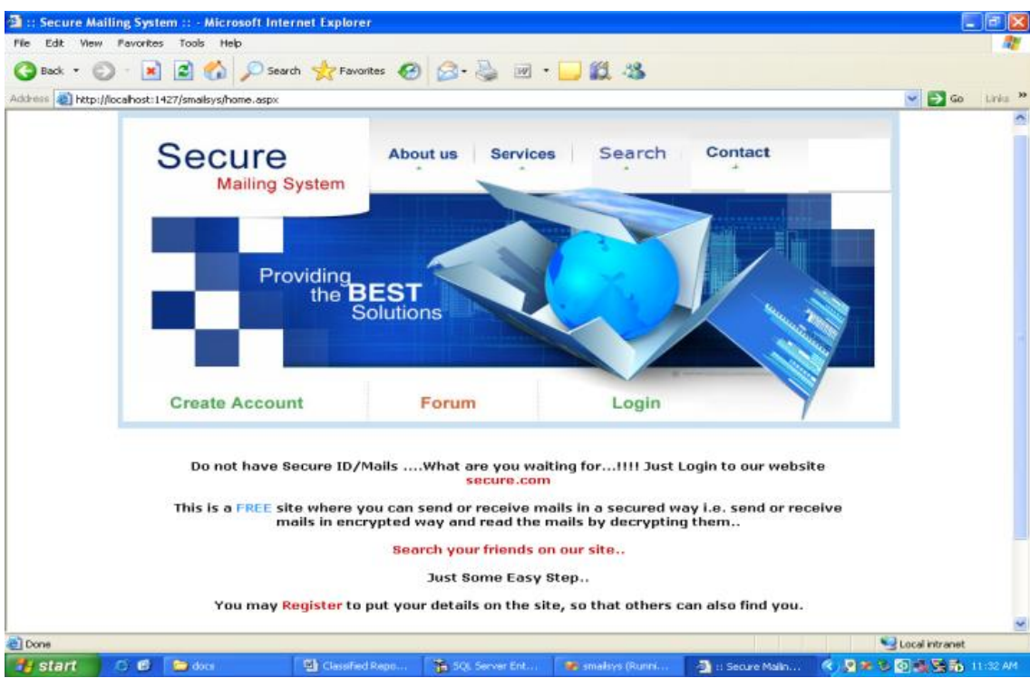
Fig 1. Example of homepage of secure mailing sytem

System design is a process of defining the components, interfaces and data of our whole system[5]. The modules being used are password module, user registration module, encrypt, decrypt module, add views module, add new topic and search module. Fig 1 shows an example of home page of our project.