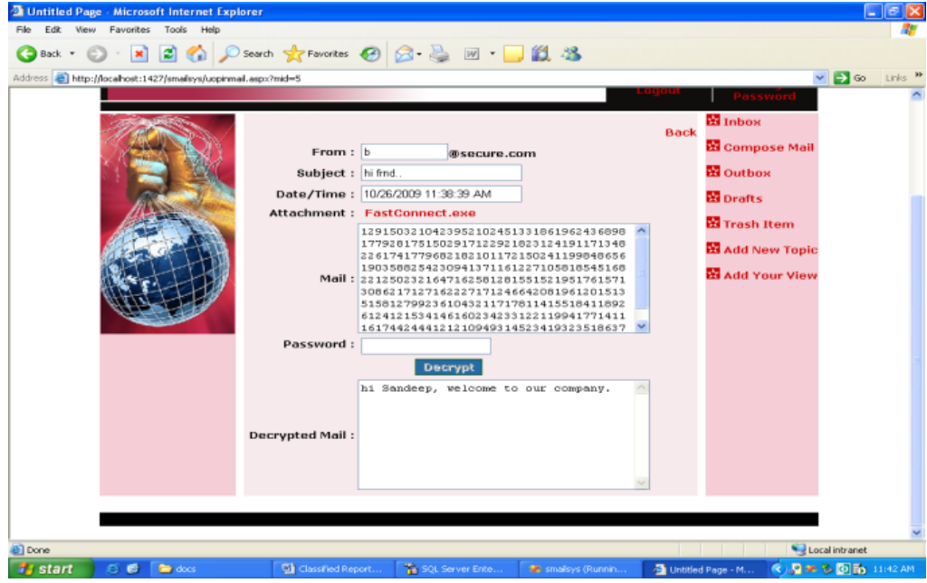
Fig. 2. Example of an decrypting mail